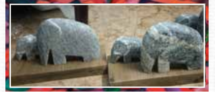
Ivory Awards Sculpture