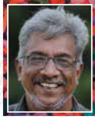
A V Sasi